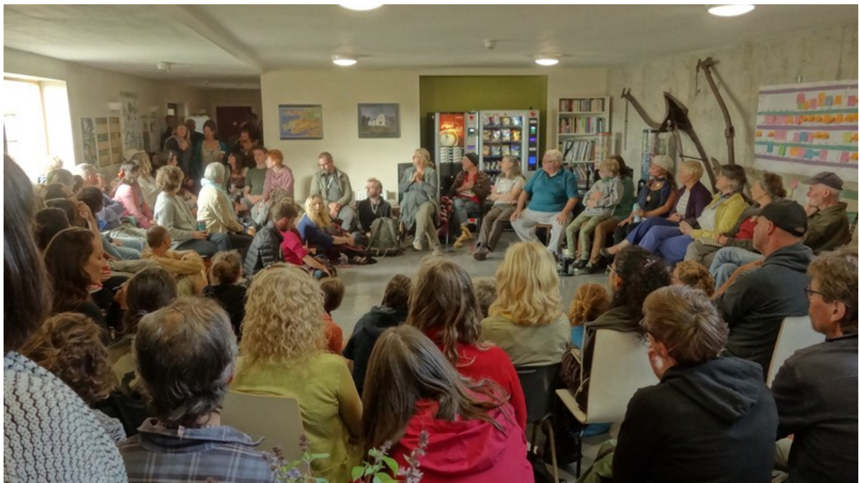
EuPC, Day 1: Honouring the Elders - Session