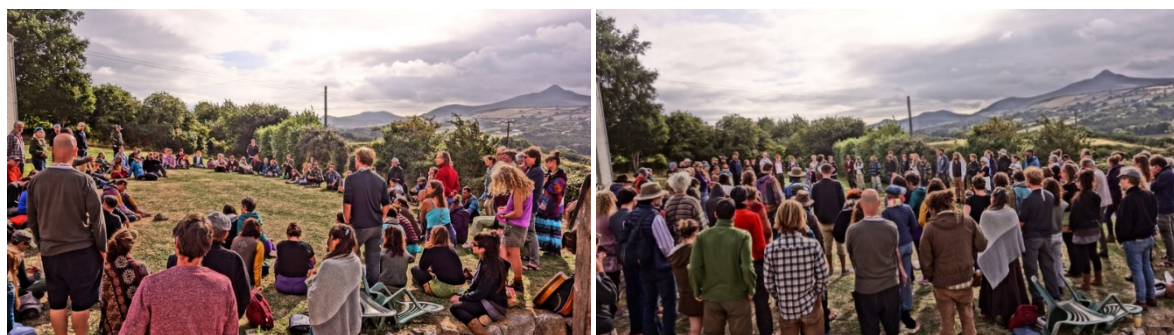
EuPC 2018 Opening Circle

It is hosted in different countries to support the growth of permaculture in that country, to add to the health of Permaculture in Europe.